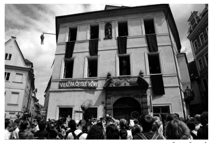
Demonstration of execution the Czech science – VRAŻDA ĆESKÉ VĚDY (=MURDER OF CZECH SCIENCE)

Moreover, common consent was found in organizing a round table discussion before end of August 2009 on how to measure and