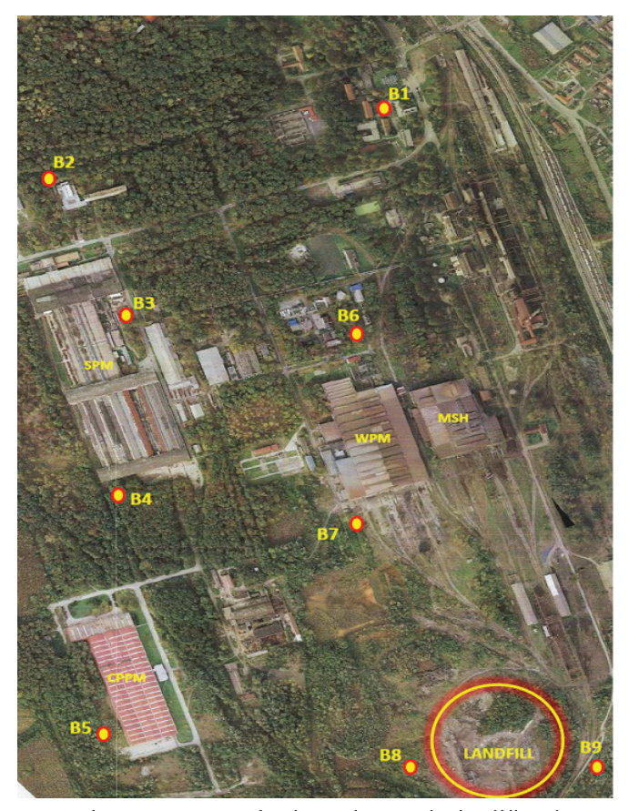
F i g . 3b – Locations of soil sampling on the landfill and areas around the production processes (B1–B9) – aerial view S I i k a 3b – Prikaz lokacija uzorkovanja tla na odlagalištu i prostoru oko proizvodnih pogona (B1 – B9), fotografija iz zrakoplova

Croatian legislation defines the Ordinance on the Protection of Agricultural Land against Pollution<sup>24</sup> as the only regulation defining the quality of agricultural soil. Limit values