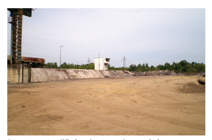
F i g . 2 – Landfill after cleaning and removal of waste S l i k a 2 – Izgled odlagališta nakon čišćenja i odvoza otpada

samples for potentially polluted areas, two composite samples from the investigated landfill area were collected. It is important to emphasize that when an average sampling method is applied, the investigated terrain should be homogeneous, i.e. there should be no difference in exposition, inclination, altitude, soil usage etc .