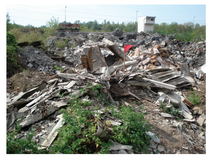
Fig. 1 – Uncontrolled waste disposal site on the landfill within battery limits

Considering the size of the investigated polluted area (about 3000 m<sup>2</sup>) and recommendations given by the Croatian Soil Monitoring Program<sup>23</sup> on the average number of